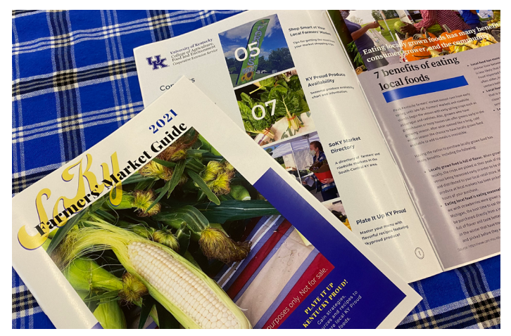
SOKY Farmers' Market Guide.

Legacy Dairy owned by the Jones family bottles milk from cattle right on their farm in Barren County. The non-homogenized pasteurized milk is directly marketed through farm markets and a growing number of KY retailers. The video is accessible online (https://youtu.be/ IMJApExF4W8) and has been shown to 197 youth and counting. It targets elementary school teachers for use in their classrooms and includes factual and industry correct information. The recording is currently in use in several area schools with plans for expanded use in the future. The video was also used in dairy education statewide.