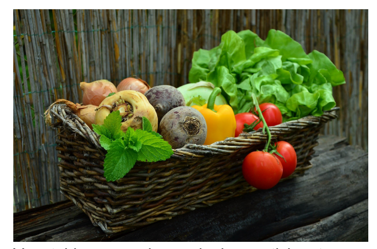
Vegetables grown by gardening participants.

Seven families participated in the Victory Garden Campaign. Families received vegetable seeds, potting soil, and a gardening calendar. 50% of these families never grew gardens before but 100% never grew in small spaces. 75% chose container gardens while 25% chose raised beds or small flowerbeds. These families were so amazed at how easy it was to grow things in containers. 100% of the families that participated harvested and enjoyed vegetables they planted. One person stated, "I never knew it was this easy and it has cut back on my grocery bill. I will definitely do this again."