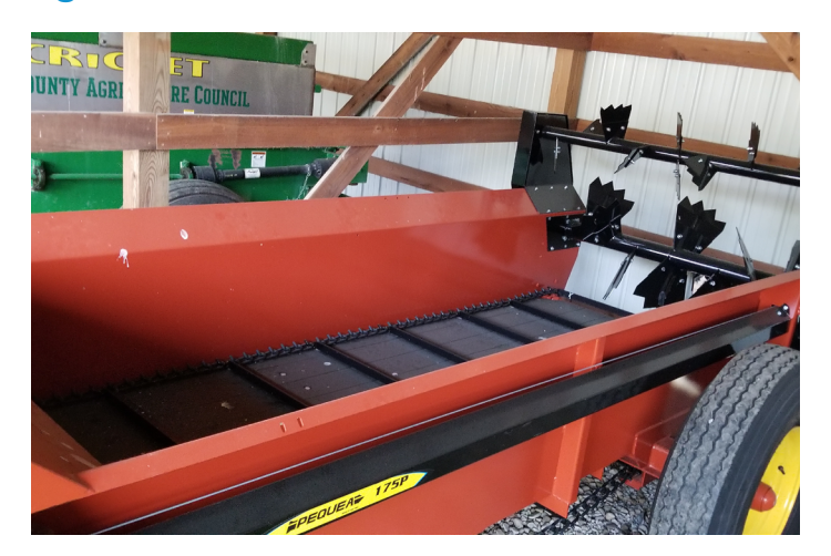
Agricultural Equipment Manure Spreader