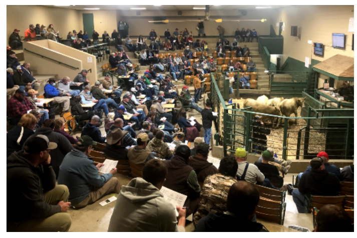
The Elite Bred Heifer Sale takes place annually the first Monday of November at the Paris

The Bourbon County Elite Heifer Program was formed in 1991 to provide a consistent, reliable source of beef herd replacement females. Rigid standards are implemented and adhered to assure consigned heifers are reproductively sound with more than adequate frame and muscle. Heifers are pregnancy checked and pelvic measured by a veterinarian and screened for body condition and blemishes by the Kentucky Department of Agriculture. The sale takes place annually the first Monday of November at the Paris Stockyards. Heifers are sold in uniform lots sorted according to breed type, size, and calving dates from each consignor. All heifers are guaranteed bred and are guaranteed to remain pregnant for 60 days after the sale. Heifers are bred to calving ease bulls and follow all health requirements of the County Agriculture Investment Program (CAIP). In 2020, 265 heifers were sold for an average $1,691, with the sale total $448,125.