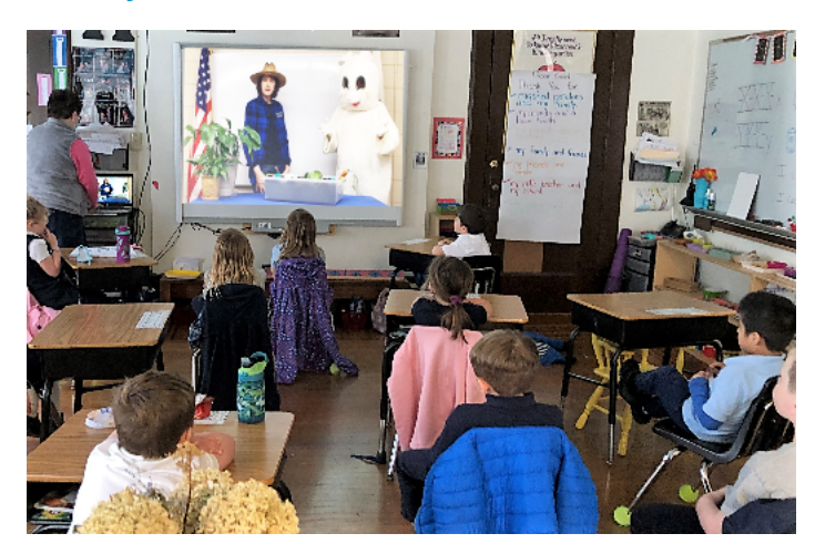
Due to COVID-19, the Peter Rabbit program was presented virtually to kindergarten classrooms