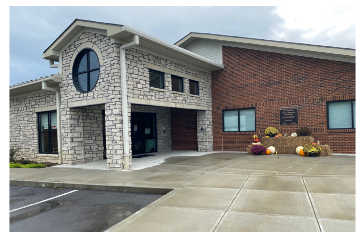
Welcome to the newly renovated and expanded Boyle County Extension Office

Due to an overwhelming constant use of our meeting room space, need for more storage and office space, we brought these issues to the County Extension Council (CEC). After months of surveys, focus groups, emails, calls and meetings the CEC expressed support for our need for a building expansion. The District Board took time to review financials to determine feasibility of this opportunity. In July of 2019 our building project began. For the last 2 years the Boyle County Extension Office has been under construction. We expanded our existing building, expanded our existing barn, build a livestock pavilion, and put in gravel paved walking trail on our property. Now that we have such a large and inviting facility we can offer new services as well as our current ones. Our office has partnered with Ephraim McDowell Regional Medical Center to be used as a COVID 19 vaccination site. Today, over 6,000 shots have been given at our office.