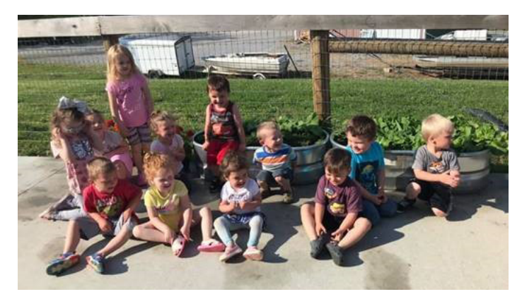
Local daycare enjoys gardening project.

Number of youth who indicated they increased their daily number of servings of fruits and vegetables eaten as a result of 4-H programs