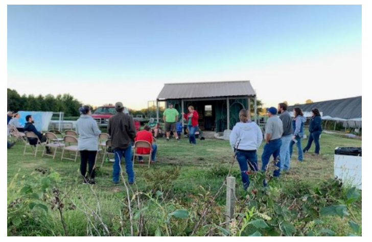
The Small Diversified Farm events educate the community on a variety of topics.

Reorganization of the 4-H Teen Council turned out to be just what the Teen Council needed. The group is more focused on leadership development and serving our community. They follow through with tasks and work together as a team. They were not afraid to take the risk of reorganizing and have learned that change can be a good thing. As one member stated, "Now, I feel like we are getting somewhere!"