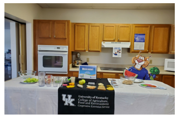
A lot of preparation goes into making a Facebook Live Series successful!

Caldwell County Healthy Choices for Every Body Facebook Live was conducted over a seven-week period. Sixteen (16) individuals signed up for the seven-week program. Lessons taught during the class focused on Choose MyPlate, reading labels, limiting added sugars, fat, and sodium. Participants also gained knowledge in meal planning, food budgeting, and food safety techniques.