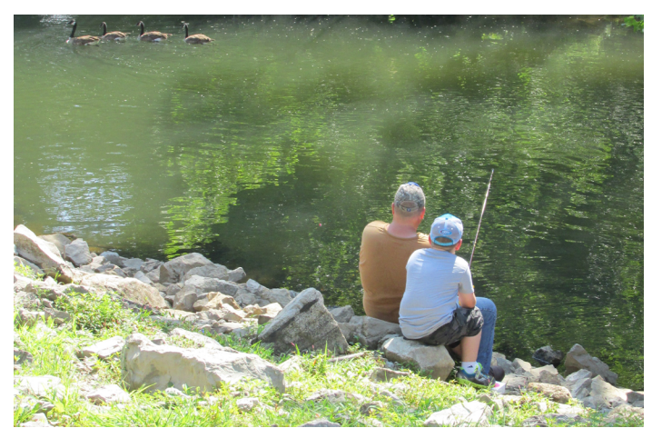
Father and son enjoying fishing

According to 24 million children in America -- one out of three -- live in biological fatherabsent homes. Almost thirty percent of families in Carter County are single parent families. In 2013 "Day Out with Dad†was developed to provide parenting education and celebrate fathers and father figures. In six years the program grew from nine participants to over fivehundred. Traditionally, the free event included fishing, birdhouse building, and games. In 2020 a drive-thru program was offered. Each family was given educational information about the important role of fathers, a book that they were encouraged to read to their children, family activities and games, and community resources. Participants reported that the program reminded them how valuable their role is as a father and they have a powerful impact on their child's success in school and life.