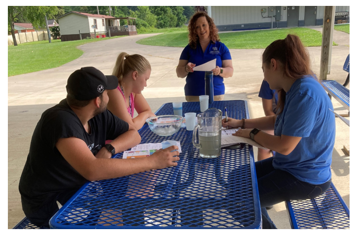
Learning health benefits of raising a garden.

This would be beneficial if they would ever need to be self-sufficient or to help care for their own families. The youth were given their own buckets in which they would plant their seeds to raise tomatoes, peppers & cilantro. Once their vegetables grew enough the youth had everything, they needed to make fresh salsa. "The salsa was the best part said one of the participants!!"