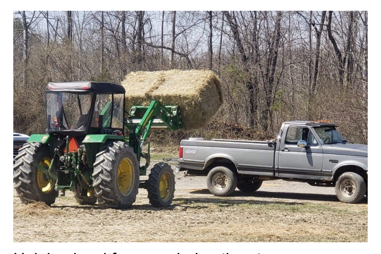
Helping local farmers during the storm