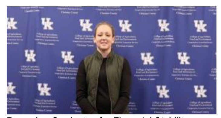
Preparing Graduates for Financial Stability