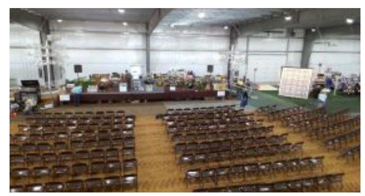
Facility Set Up for Haiti Benefit Auction

The 2021 Kentucky Haiti Benefit Auction was part of a much larger 7 state effort of the Haiti Benefit Auction of Pennsylvania. The HBA of PA has been hosting auctions for many years as part of an effort to provide the Haitian people relief from poverty and extreme living conditions. On May 14th and 15th of 2021, the Christian County Cooperative Extension Service was privileged to host the 11th annual KY Haiti Benefit Auction. The first night of the auction saw nearly 1,000 people come to participate in a free fish fry, entertainment, and auction. Day two of the auction saw another 1,000-1,250 people. At the conclusion of the auction over $300,000.00 was raised to support the Haitian people. The HBA of KY had seen the auction grow 10-15 thousand dollars for the past ten years. With the new venue and support from the local community the auction grew over $100,000.00 in 2021.