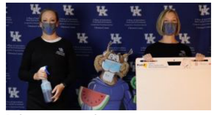
"MOVE, LEARN, KNOW"

Prior to the 2020-2021 school year, local Family Resource Youth Service Center directors reached out to the Family & Consumer Sciences and 4-H Youth Development agents to assist in providing programming to students that could not be fulfilled through traditional means due to COVID-19 restrictions. In response to the request, a video series of engaging, interactive lessons covering a variety of hygiene lessons was developed for students in second through sixth grade. Lessons covered: handwashing, masks & social distancing, spreading germs, oral health, and body care. For many of the hygiene lessons, permission was given to use video resources from the University of Kentucky Family & Consumer Sciences. Agents used a variety of technology platforms to produce, publish, and distribute materials. Links to each video were sent to Family Resource Youth Service Center directors for distribution to teachers.