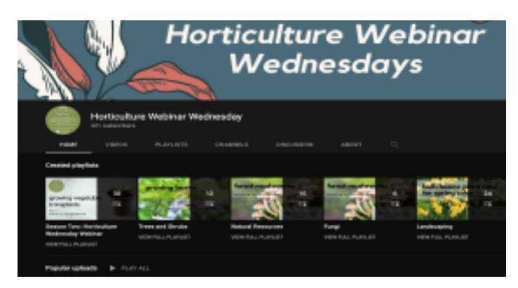
Horticulture Webinar Wednesdays