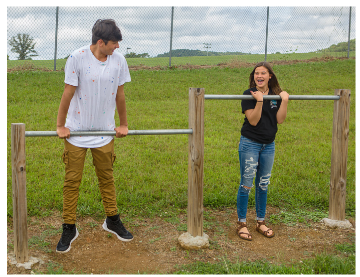
The Fit Trail encourages a variety physical activity for all ages, hosting the bike safety rodeo and Storybook Walk.

Citizens in Clinton County suffer from alarmingly high rates of child and adult obesity, diabetes, and heart disease. Community members of all ages need access to healthy foods as well as increased and enhanced opportunities for physical activity.