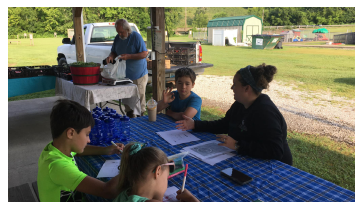
Youth participating in the Kids Bucks program at the Elliott County Farmers Market