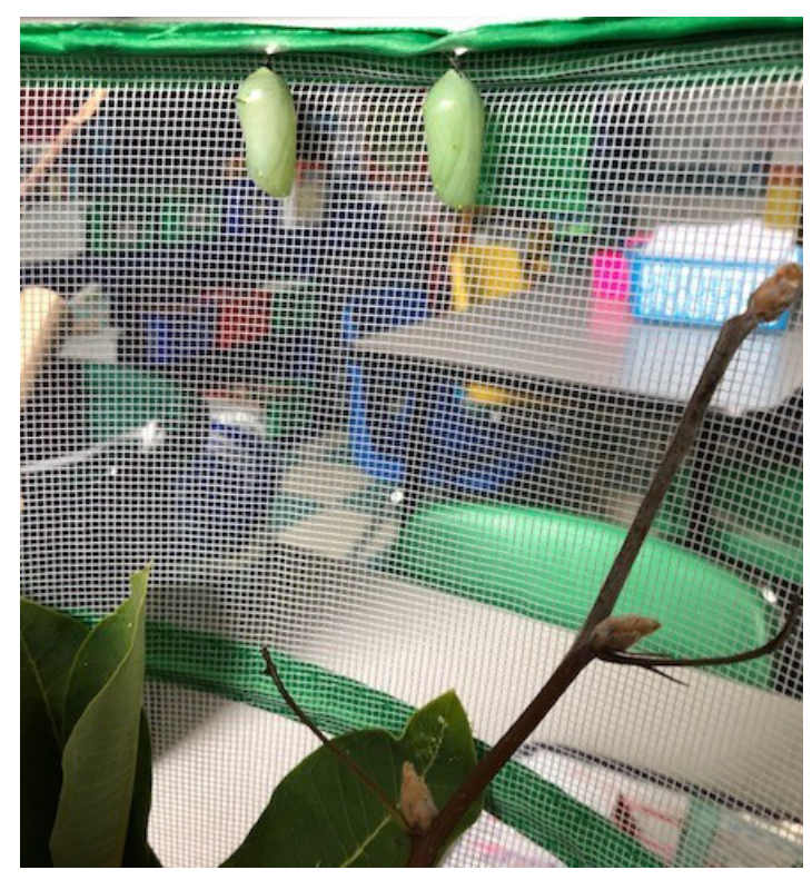
Monarch butterflies will soon emerge from the two green pupae in this classroom observation habitat.

Extension Agents work closely with local school teachers to identify needs for experiential learning in science that fulfills state academic standards. In Kenton County , 4-H Youth Development and Horticulture agents collaborated with 10 teachers from 4 school districts in the county. Over 950 students in kindergarten through 6th grade participated in guided hands-on science investigations using Project Butterfly Winning Investigation Network for Great Science (WINGS) curriculum. Students identified needs for living things, recorded the lifecycle stages of butterflies, and discovered the responsibility of caring for living things.