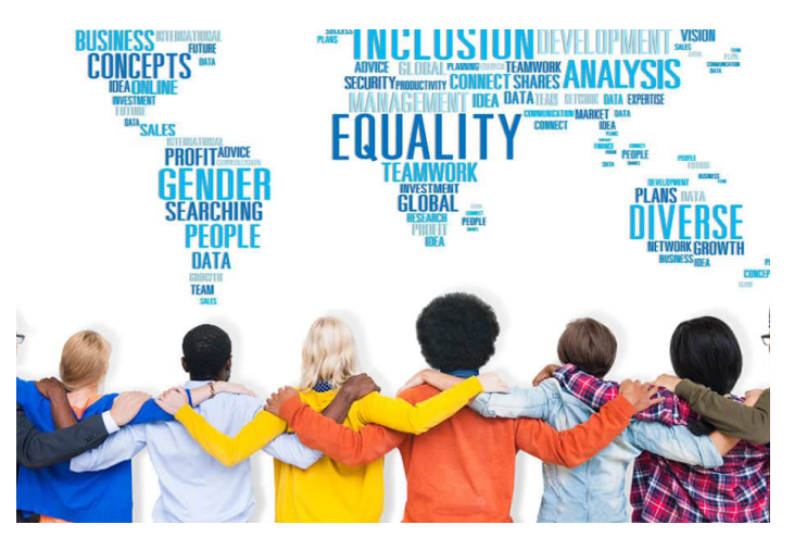
Embracing community dialogues on race.

The information shared with participants increased understanding of how racism affects communities and quality of life and its role in our national history. The short-term goal is to build relationships, and to review national, state, and local data in order to determine if the community is making progress in a variety of areas. The long-term goals are to build a community where everyone in Franklin Co. is welcome and able to thrive.