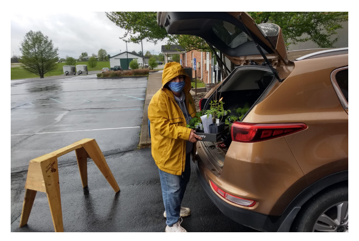
CAEMG volunteer delivers plant orders during their 2021 Online Plant Market.