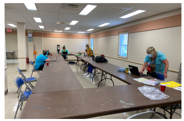
Extension office provides Internet access to aid in student's virtual learning.

The program was offered to students residing at the mobile home park. They came to the Extension Office three days each week for virtual learning and received assistance with schoolwork. The School Board loaned hotspots and headphones for students who participated. From August to December, an average of 12 students, grades 1st through 9th participated. At the end of the program, nearly 90% of participants agreed that "the program helped me to concentrate better and receiving help with my work was helpful."