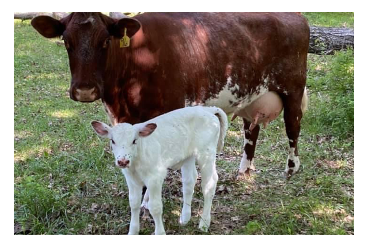
Local beef producers find a new way to communicate.