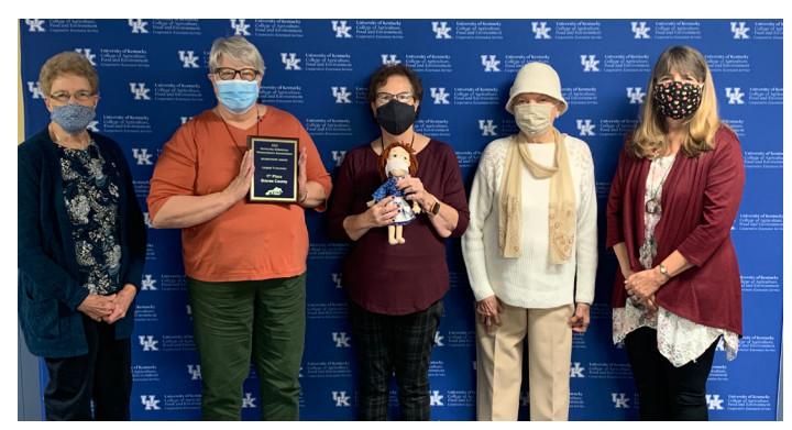
Largest Percentage Membership Growth