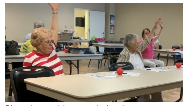
Bingocize participants enjoying the game.

Recently, the Bingocize Falls Prevention Program was offered in Green County. A total of thirteen participants signed up to complete the program. At the end of the program, participants reported that they felt more confident in their abilities to reduce falls, gained skills to help protect themselves in the event of falling, and felt that they had become steadier on their feet. All participants reported that they would recommend the program to others and would participate again in the future.