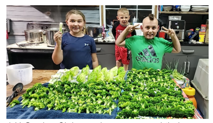
4-H Garden Club members preserved their homegrown produce for enjoyment in the off seasons.