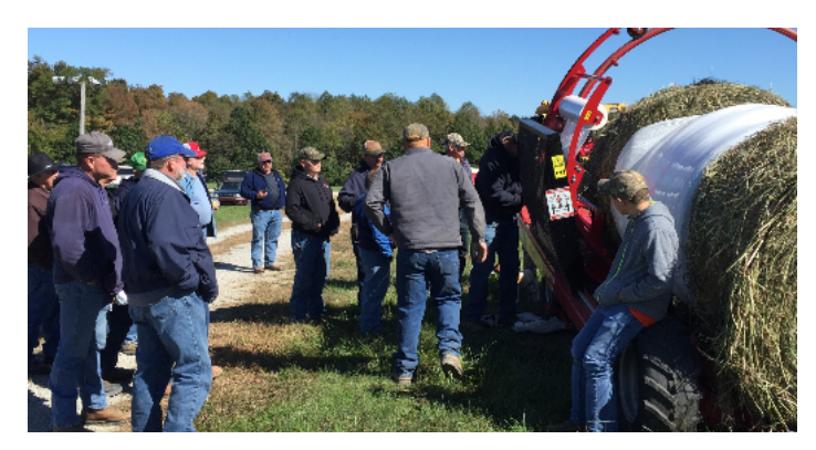
Forage Field Day participants stand by while a hay wrapper is being demonstrated.