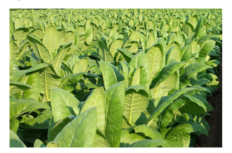
Frogeye Trial Tobacco in the field