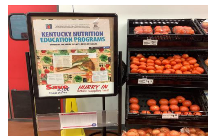
Display board at Save-A-Lot

Handouts were placed in the 3-slot tray for customers to pick up and the display board was updated with different nutrition information and recipe each week. Over 5,000 helpful handouts which included topics of fruits, vegetable, handwashing, food safety, and recipes where picked up by customers over a six month period. The partnership with Save-A-Lot grocery has put nutritional information in the hand of Harrison County residents at a time when social distancing was still needed.