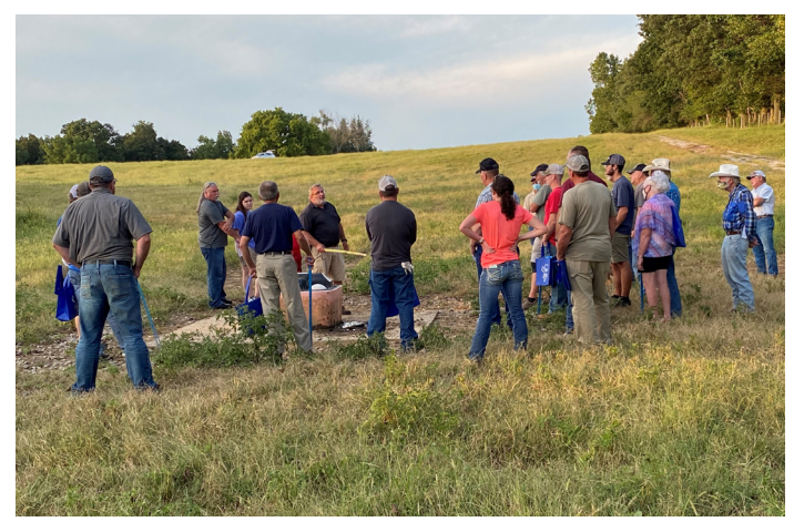
Producers Participate In A Pasture Walk.

With these facts in mind, Agriculture Extension agents in Webster, Hopkins, and McLean Counties organized and held a Regional Beef Field Day for beef producers in the Tri-County area. These field days offered producers an opportunity to see how production practices are implemented on local farms. Field days also promoted adoption of new practices that improved production efficiency while protecting natural resources, which are goals outlined in the county plan of work. Sixty-two producers indicated their desire to make changes in their operations.