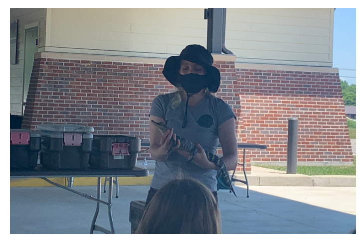
Kentucky Reptile Zoo

Of the 18 youth who came, 15 took our survey. We learned that of the 15 youth only 1 person had never been to Mahr Park. 14 of the youth learned something and felt they knew how to make a difference helping protect the Earth. 10 of the 15 youth indicated that they wanted to learn more about natural resources and the environment!