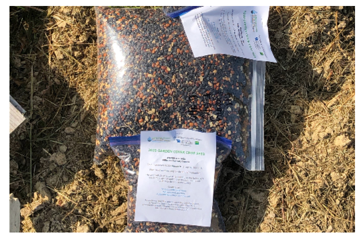
Bags of cover crop seeds ready to be delivered across Jefferson County.