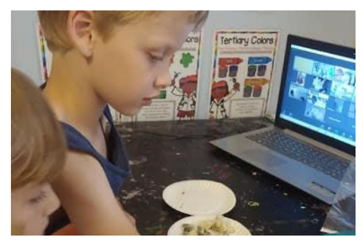
4-H members dissecting owl pellets during a virtual STEM club meeting.