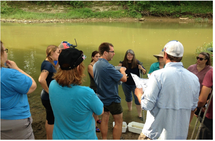
Floyds Fork Creek, Water Quality Assessment Class, KY Master Naturalists.

UK's KY Master Naturalists training classes are nearly complete. The 16 week training. which was geared for UK Extension Agents, staff and specialists, in all 120 counties, will conclude May 28, 2021. Topics covered, Ecoregions of Kentucky, Ecological Concepts, Archeology, Geology, Soils, Entomology, Weather and Climate, Water Resources, Botany (Woody Plants), Botany (Herbaceous Plants), Wildlife, Invasive Species, Outdoor Safety and Health, Environmental Education & Ethics, Citizen Science and Outdoor Learning Environment. Jefferson County is tentatively making arrangements to host another class late summer, early fall. Check back with our Extension office web page and Facebook page for further details.