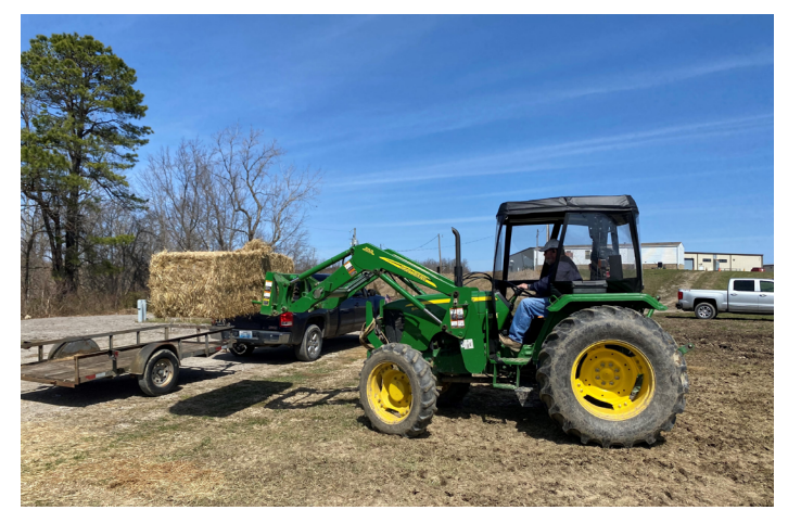
Loading hay during relief efforts.

A devastating ice storm hit Northeast KY in February 2021 & was followed by flooding. The ice storm left many without power or any amenities for several days & took out large areas of farm fencing when large trees and limbs either broke or were uprooted & fell on the fence. As local farmers were slowly beginning to get out from under that catastrophe the widespread flooding began. In response to these disasters the Boyd, Carter, Greenup, & Lawrence County ANR Agents organized a storm relief effort to benefit local farmers. Donations came from across Kentucky and also from Ohio and Pennsylvania. In addition to requesting hay & fencing supplies, agents also received $9,700 in donations to purchase fencing supplies. Local farm stores provided a discount on fencing supplies. The farmers were very appreciative of this assistance for their farm operations. 58 farmers in Lawrence County participated in the flood relief program.