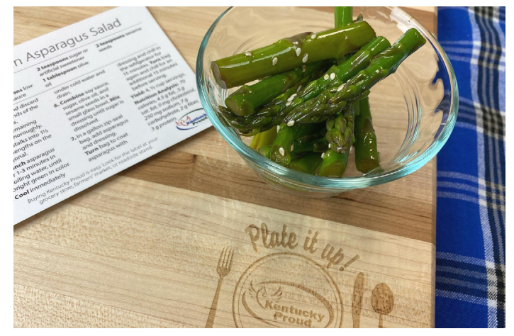
KY Proud Plate It Up Recipe provided to Food Bank participants.

Individuals and families often receive foods from the pantries that they are unaware for how to prepare and/or store resulting in expired foods & food waste. Healthy Choices for Everybody Curriculum on the topics of how to store/prepare food was handed out with the goal of reducing this food waste. Recipes were paired with distributed foods and information with specific foods received from the food pantry. This was done to give families the tools needed to prepare nutritious meals