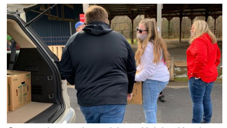
Community members giving a Helping Hand

This program worked to alleviate food insecurity in our community due to the COVID-19 Pandemic. This was a county wide effort made by Extension, Schools in our county, FFA, 4-H, local officials and businesses.