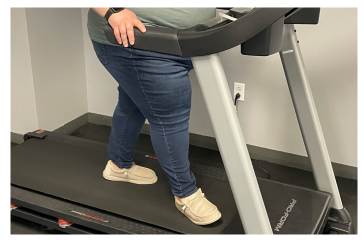
A Get Fit, Logan County participant walks on the treadmill.

Participants met twice a week for the four week wellness program involving nutrition education and physical activity. During each session participants utilized Wellness Center equipment to exercise and participated in a lesson from the Healthy Choices for Everybody curriculum. One hundred percent of program participants showed improvement in the following areas: diet quality; physical activity; food safety practices; behaviors in meal planning, making shopping lists, cooking at home more often, and utilizing food on-hand.