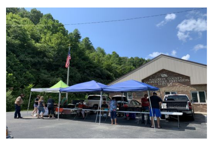
Social distancing continued through the COVID 19 pandemic.

For the fourth year, the ANR agent received a $2,667 KY Double Dollars grant from Community Farm Alliance to enable WIC and Senior FMNP participants to double their vouchers, up to $12 per day. This grant allowed more than 100 participants to double the amount of fresh produce they were able to provide to their families. In addition, the local farmers nearly doubled their market income. Participants and farmers alike continue to be appreciative of the program.