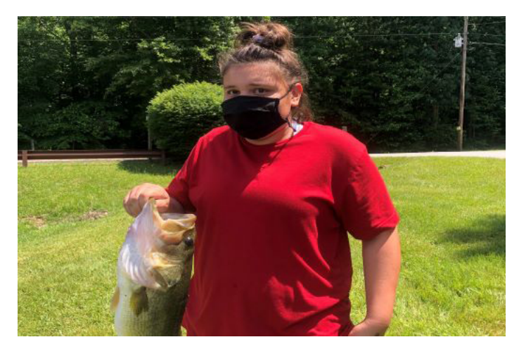
One of the biggest bass ever caught at camp!