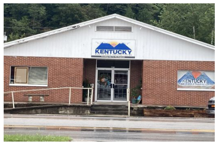
Kentucky Mission Bible Training Center is learning about Recovering Your Finances.

Twelve clients participated in the Recovering Your Finances Program, learning about budgeting, avoiding spending traps, prioritizing spending, and saving money for emergencies. The classes were interactive and clients were eager to participate and learn. As a result, KMBTC has asked for the program to be repeated to future clients.