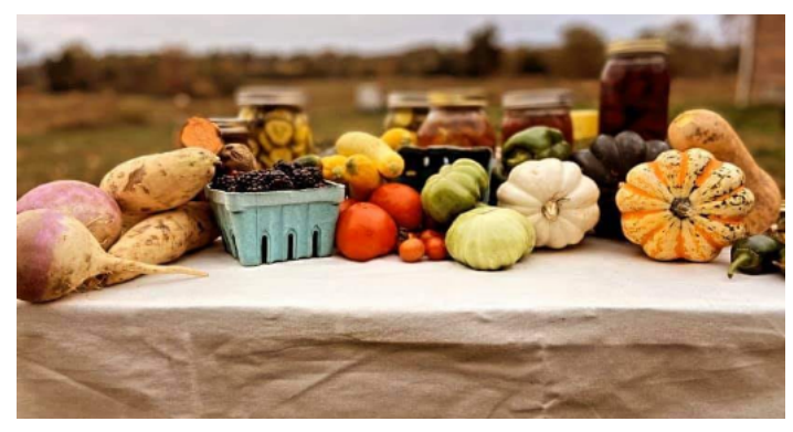
A beautiful display of products at the Lebanon KY Farmer's Market.