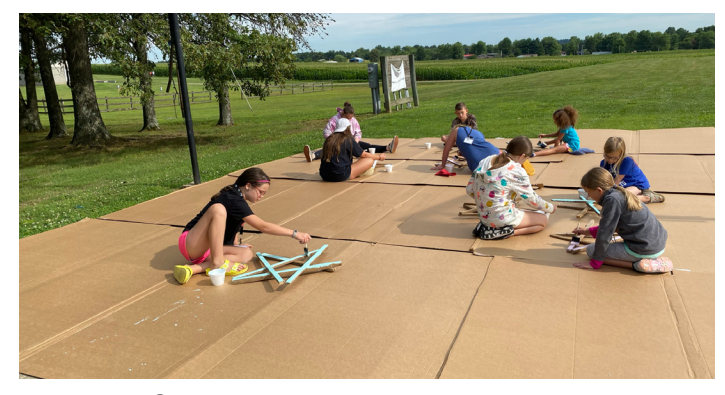
4-H Day Camp Participants enjoyed painting tabacco stick crafts.