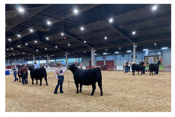
Potential beef producers exhibiting their project animals