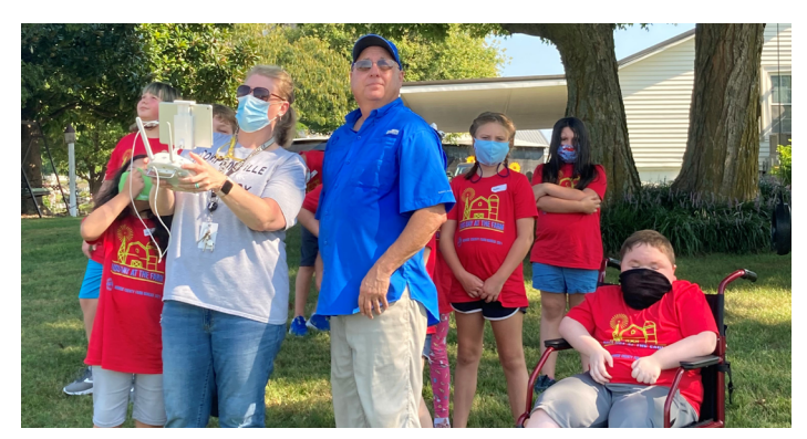
Drone demonstrations are a popular way for youth to learn about new ag technologies.

The virtual field day was held using the Zoom platform. The 112 attendees were able to ask questions of the presenters. Over 96% rated the virtual field day as an excellent program, and 28% indicated they will make a change to their farming operation. One attendee stated, "l work days and I really appreciate that the program was in the evening where I could watch it with my family and learn together.â€