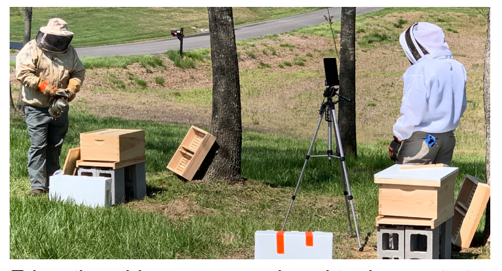
Education videos were produced to demonstrate the installation of honeybees into a hive; beehive

The Monroe Co. ANR Agent installed four additional hives in April of 2021. The beehive program has resulted in more people being made aware of the importance of bees to our crops and environment. This program has provided a habitat for eight colonies of bees and has increased pollination of nearby crops. Three other individuals have installed beehives locally as a result of this project.