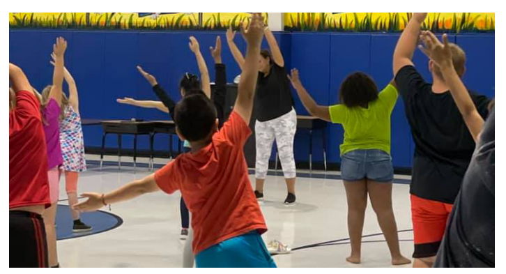
Tompkinsville Elementary Students learn the benefits of Yoga.

The teachers commented that the youth were more ready to focus on assigned tasks following the classes. Pos-program evaluations showed that 87% of the youth felt they could use their breath to help be more calm and relaxed. 83% would like to continue the yoga class.