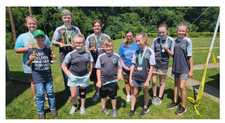
Teaching life skills, ethics and self confidence through 4-H Shooting Sports programs.