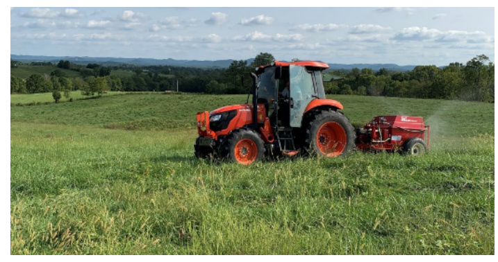
New Sprayer Purchased for Farmers Use in the Community.

Pasture forages provide the majority of the nutrients for Montgomery County beef cattle and other livestock. Due to weather conditions, winter feeding areas and in some cases over grazing, weeds such as Buttercup have become a major problem in many pastures. These weeds compete with and reduce the availability of our desired grazing forages. The Montgomery County Extension District Board purchased a special sprayer for the ANR Agent to make available to Montgomery County farmers to help combat pasture and hayfield weed problems. In March, we completed our first Buttercup Spray Program. Sixteen farmers participated in this weed control demonstration program and sprayed 340 acres of pasture to control buttercup as well as poison hemlock and thistles.