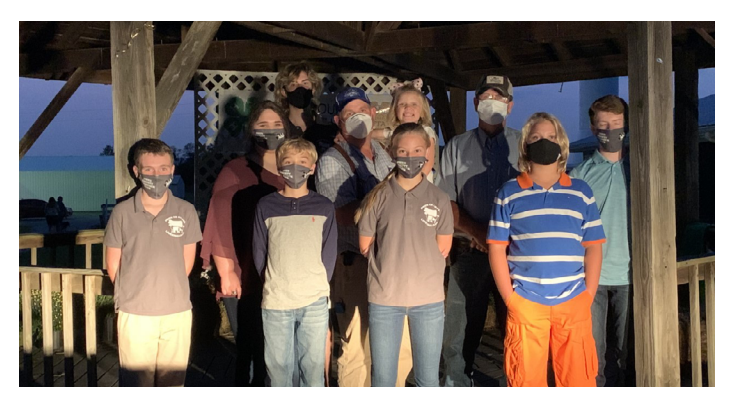
Pictured above are the Owen County Livestock Club members with one of the buyers who contributed to each members sale.

The Owen County 4-H program was without a 4-H Agent for several months. The 4-H adult advisory council expressed the need to discuss and safely plan the 4-H Livestock Club Youth Investment Sale, during a pandemic. The Livestock Council also wanted the youth to be able to experience the sale of their animal to gain financial literacy skills; the video was used for the sale. The Owen County 4-H Livestock Club Youth Investment Sale had 26 buyers from Owen County or the surrounding area to participate virtually. In the past years, those youth that participated in the 4-H Country Ham project had the option to sell their ham in the investment sale and a silent auction was held for those participants. In total, the program had 15 youth participate whether it was a livestock/ hams. Due to generous donations, we were able to raise almost $18,000.00 that goes back to the 4-H Livestock Club in Owen County; to sustain the program for many years to go