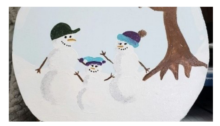
Snow globe door hanger made from the first kit.