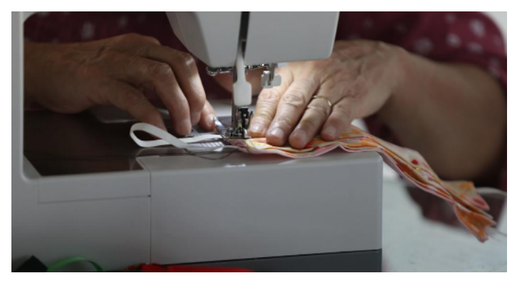
Sewing needed supplies for the Covid19 pandemic.