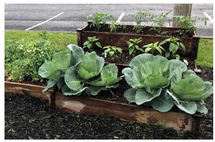
Tomatoes, snow peas, cabbage, and more fresh vegetables to try!

She also constructed a raised bed at Adanta Clinical for their clients and a raised bed for the local head start program to utilize with their children. She has since completed another raised bed for Horizon Adult Day Care for tomatoes. She helps plant the beds and assists the clients with maintenance and gardening questions. The clients weed, water, and then get to harvest fresh vegetables to try in NEP recipes.