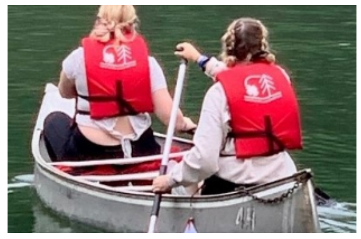
Campers enjoying canoeing/kayaking during 4-H Camp.

Campers participate in archery, rifle, climbing, swimming, canoe/kayak, arts, outdoor living, caving, and sports classes. They are given opportunities to learn new skills, as well as advance skills they already possess even at 50% capacity in 2021. At the conclusion of camp, a follow-up survey on the impact of 4-H camp was completed. 91% indicated they want to go again. Over 75% of campers indicated that because of camp they have made friends, able to make decisions on their own, and able to work with people different from them.