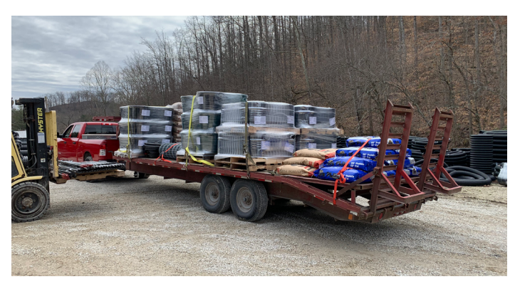
A trailer load of supplies getting ready for delivery to farmers.

The Office also served as a centralized location to receive agricultural items. Farmers were able to pick-up hay, livestock feed, and fencing. ANR agents in the affected counties also came to pick-up supplies to give to their producers. Donations were received from across the state, and the nation. In total, over $150,000 in donations were received by the Office.