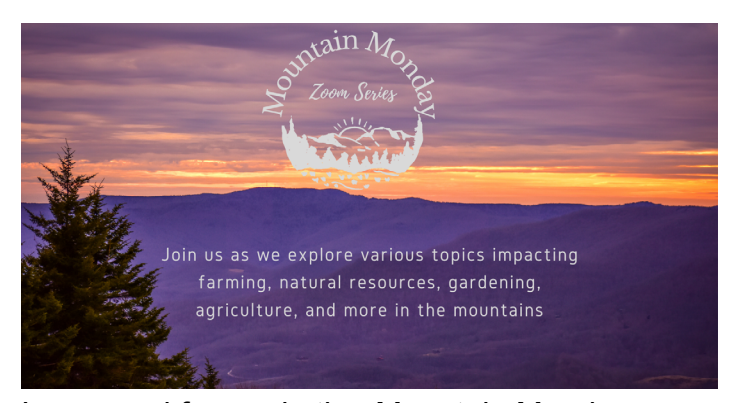
Logo used for marketing Mountain Monday

In response to COVID and the desire to continue programming, the Wolfe County ANR Agent offered a weekly virtual program for clients. The series was titled, "Mountain Monday Zoom Series" and it invited participants to "explore various topics impacting farming, natural resources, gardening, agriculture, and more in the mountains." The series began in February and continued through April. Topics included: Small Ruminant Management, Preparing for Spring Gardening, Calving & Calf Health. Diagnosing Problems in the Home Lawn, Fruit Tree Grafting, Marketing at the Farmers Market, Raised Bed Gardening, Pond Management, Mushrooming & Foraging 101, and more. The series was a great success with many of the sessions having over 20 attendees. Participants indicated that they enjoyed the topic(s) and have gained valuable knowledge. The sessions were recorded and are available on the Wolfe County Extension YouTube page for later viewing.