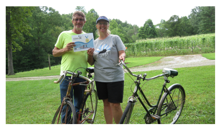
Recovery Run 5K Participants